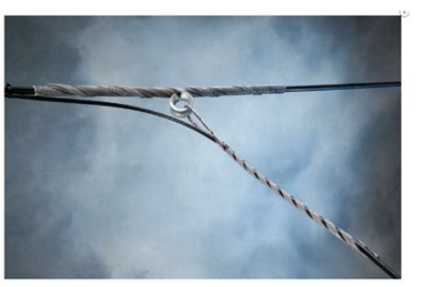
PLP mid-span drop attachment

Mid-span drops attachments are available to attach a flat drop deadend to an ADSS mid-span in a "flying tap" configuration. However, OFS does not recommend the use of these. The main reason is the drop cables add additional forces in both the horizontal and vertical directions depending upon the length of the drop, and it is hard to predict the impact of the additional forces associated with these drops on the main ADSS cable line.